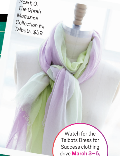
Scarf, O, The Oprah Magazine Collection for Talbots, $59.

Watch for the Talbots Dress for Success clothing drive March 3-6 , with collection bins in every store!