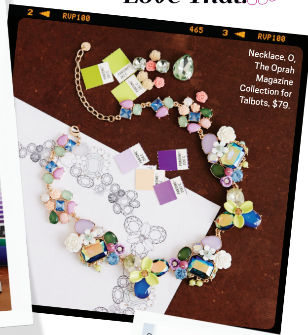
Necklace, O, The Oprah Magazine Collection for Talbots, $79.